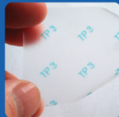
TissuePatch 3 TM