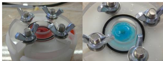
Figure 1 – Burst Pressure Test Rig

The collagen film was placed on the base of the test rig (see figure 1). The top of the rig was fixed in position, and secured using o-rings and wing nuts. Saline was delivered at a rate of 2ml/minute via a peristaltic pump and a digital pressure gauge was used to monitor the pressure to the point of failure.