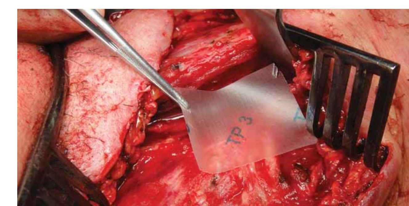
4. A piece of Tissue Patch 3 acted as an adjunct for effective seal