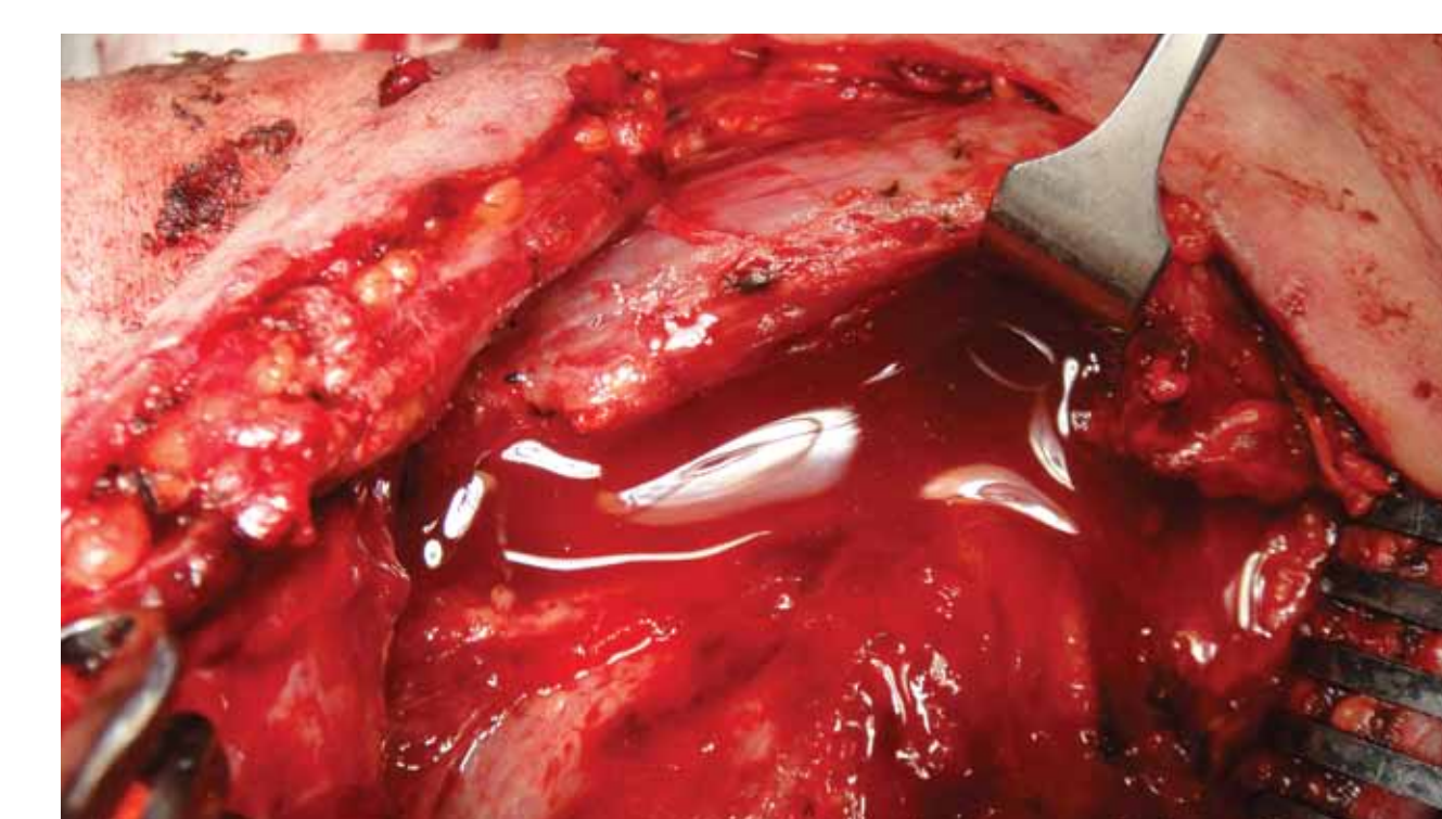
2. Re-exploration of neck revealed serous and chylous leak