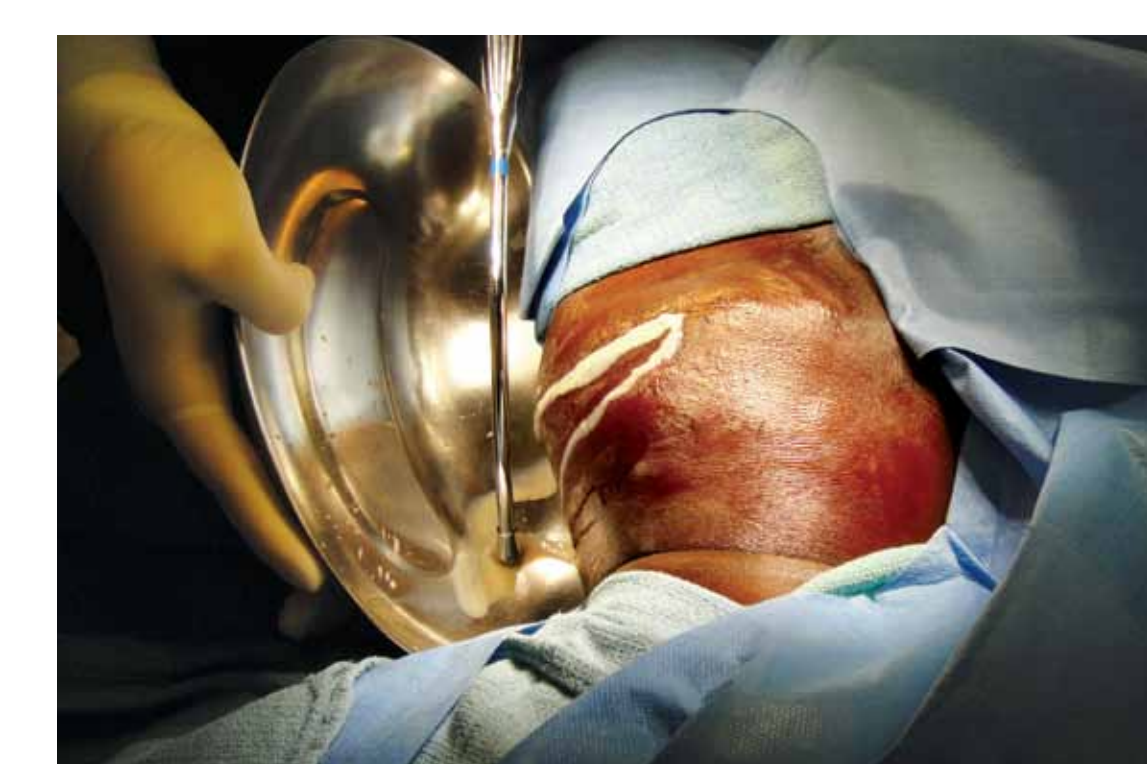
2. Chylous collection of creamy lymphatic drainage after an initial incision