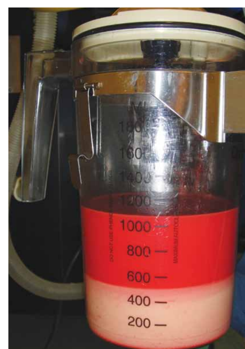
3. Initial drainage of chylous leak