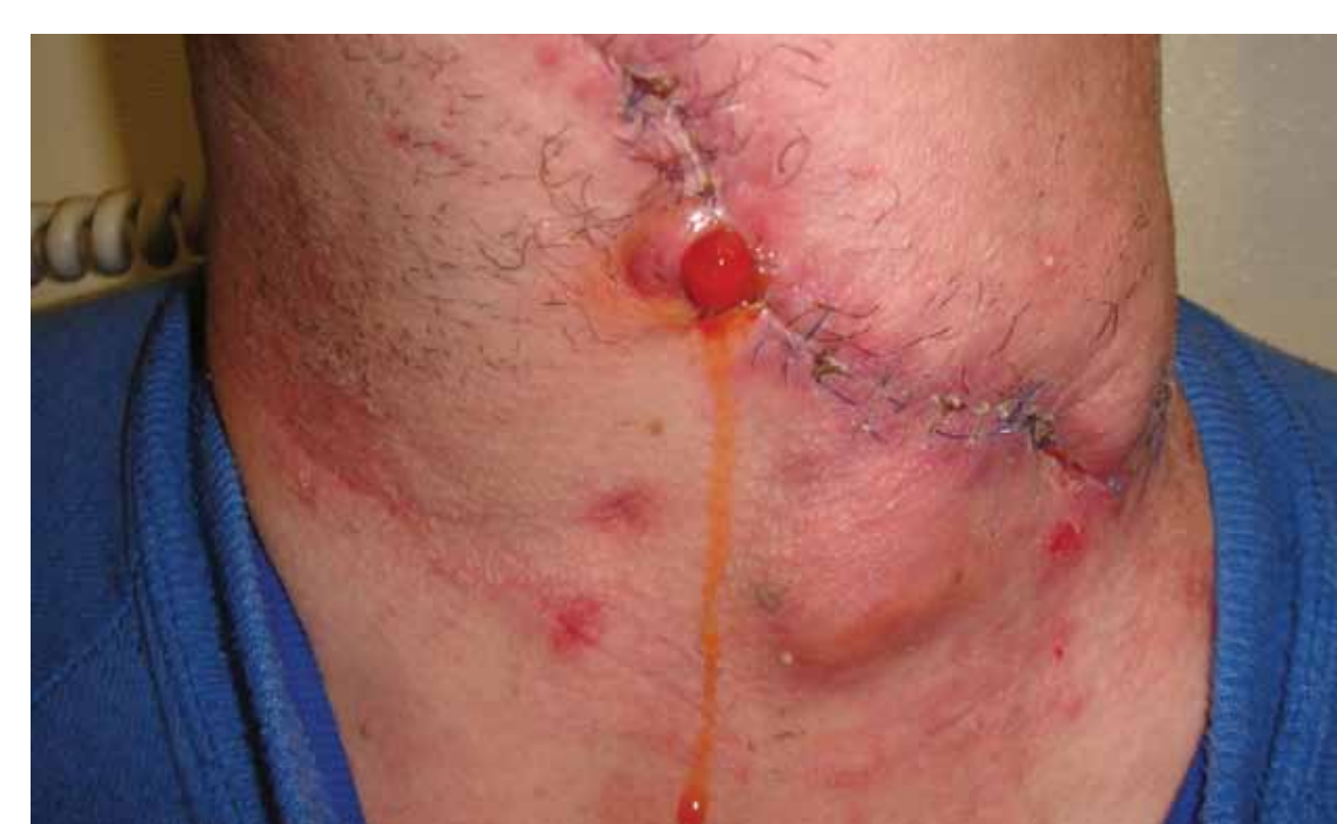
1. Chylous leak after neck dissection

was seen in the vacuum suction drain. The drain was removed and a pressure bandage was applied. Chylous leak continued with more than 300ml per day. His left neck was explored and an extensive collection of chyle was evacuated. The chylous leak was identified, oversewn and Tissue Patch 3 was applied over the soft tissue. No further leak was identified with Valsalva maneuver. He remained well and received postoperative chemoradiotherapy.