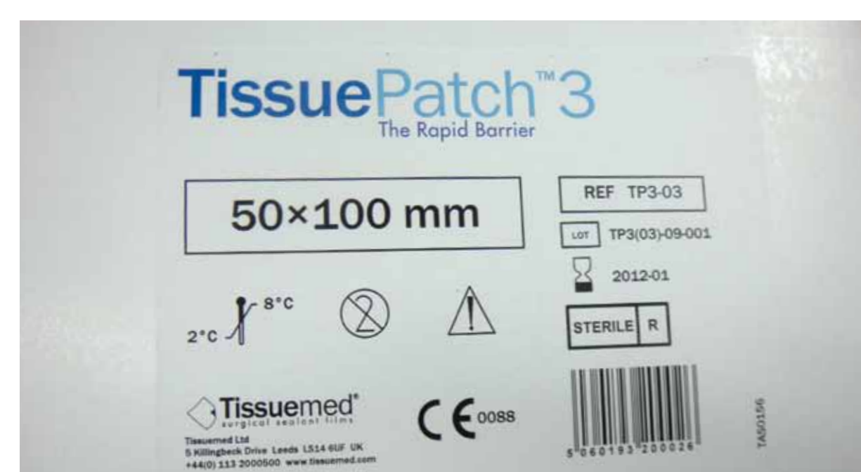
3. Tissue Patch 3