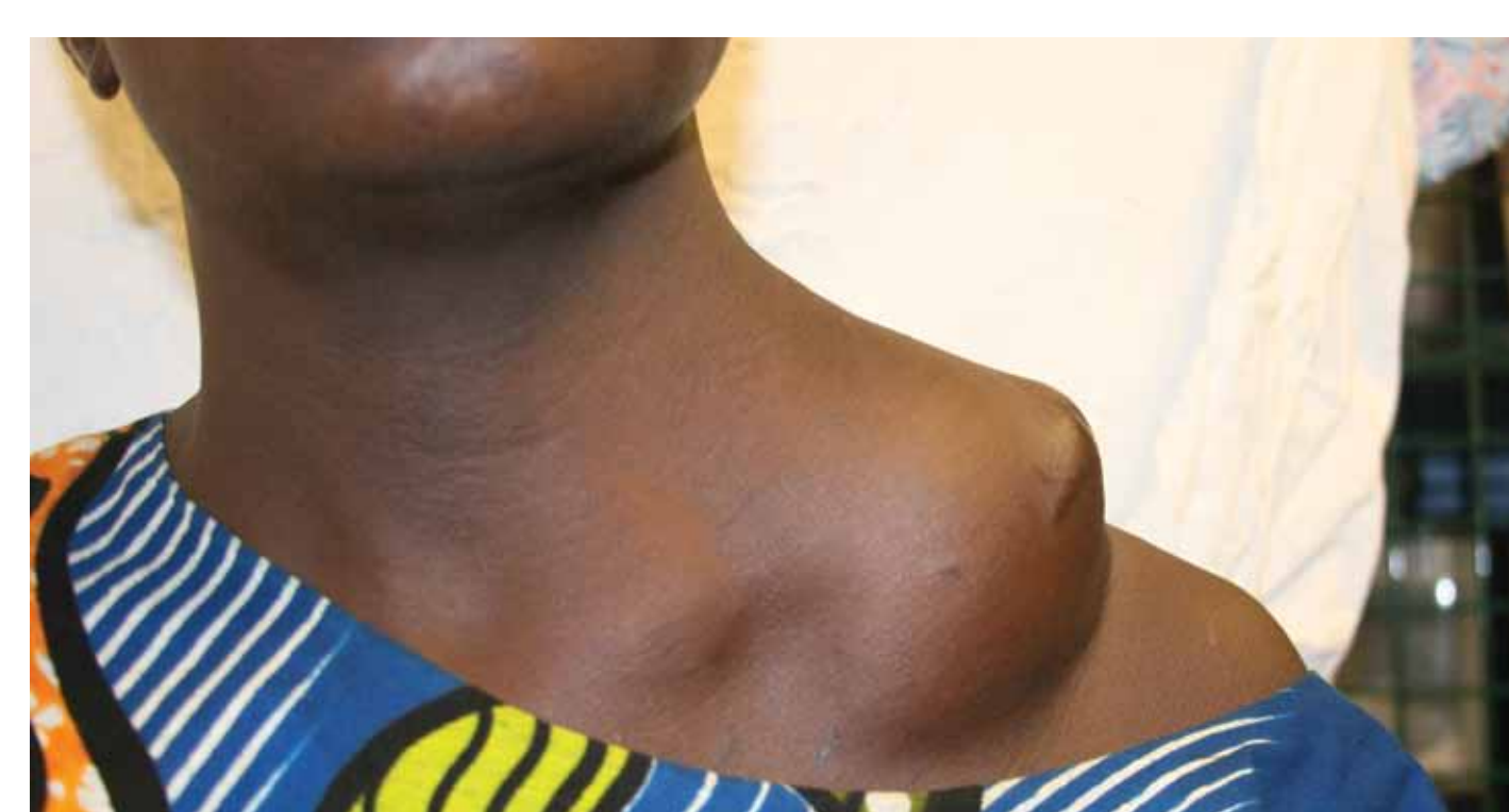
1. Large supraclavicular teratoma

collection of over 1 liter of blood-stained chyle. Chylous leaks were identified from 3 sources, 2 at inferior and one at mid cervical regions. These areas of leakage were ligated and oversewn with surrounding soft tissue. A 50 x 50 mm Tissue Patch Dural was cut into 2 small pieces and applied over 2 inferior leaks. The patch provided an effective water-tight seal with no chylous leak on Valsalva maneuver. The patient developed a firm supraclavicular swelling and re-exploration of the neck reviewed leakage of chyle from a dilated mid cervical lymphatic channel. The other 2 previous sources of leakage at the base of the supraclavicular cavity sealed by Tissue Patch Dural, remained dry with no leak.