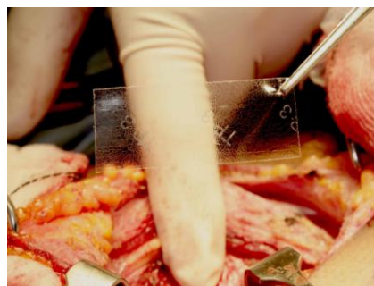
Strip of TissuePatch3 prior to application.