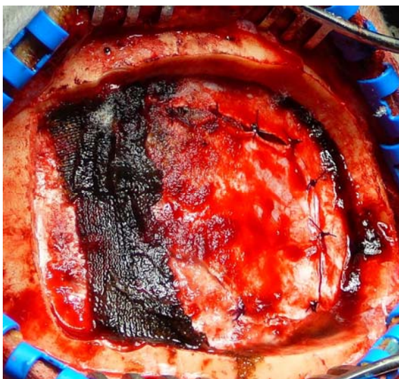
Figure 1 Dura closed with interrupted sutures

A 100×100mm TissuePatchDural™ (TD-04) was used. It was trimmed slightly to allow better conformity to the craniotomy site and was then applied as per instructions for use. During placement, the patch rapidly conformed to the contours of the underlying tissues. It provided an immediate and effective seal to CSF leakage as an adjunct to the sutures (figure 2).